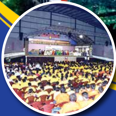
Tech - Auditorium